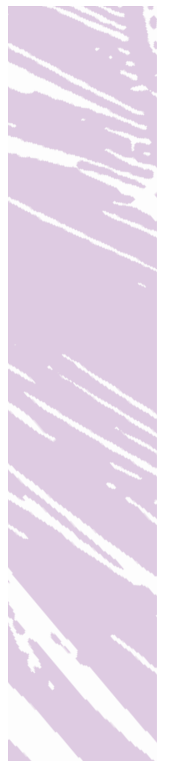
16 Criminal Code of Ghana, 1960, Act 29 sections 58,59 & 67

17 Fred Sai. An overview of unsafe abortion in Ghana- A Foreword. African Journal of Fertility, Sexuality and Reproductive Health. 1996, 1 : 2-3